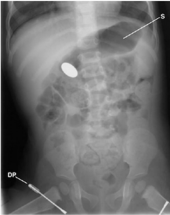
Figure 3 This anterior posterior radiograph of the abdomen displays the metal coin over the region of the atrium of the stomach.